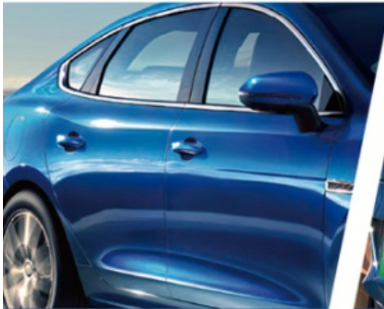
The dragon sprang his waist