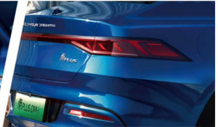
Through-through LED tail light