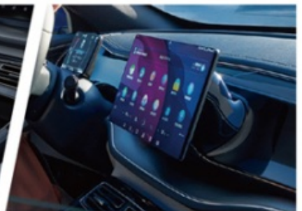
DiLink 3.0 intelligent network system

Enveloped-type wide suspension cabin Luxury NVH quiet space Sport seats Advanced color matching DiLink 3.0 intelligent network system