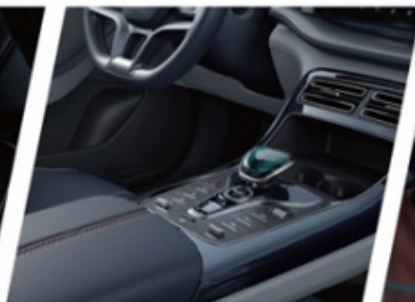
Advanced color matching